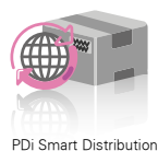
PDi Smart Distribution

Variable data printing merges the content from a database with a master document template and outputs that document on a digital printer. Every page generated can carry unique information, messages and/or images targeted at the individual recipient. Personalisation increases the document's attractiveness and improves the effectiveness of the message it contains.